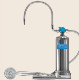
Anespa DX $2890

The exclusive ANESPA DX Home Spa System transforms your ordinary bathroom into a natural hot spring resort. ANESPA DX produces a continuous stream of healthy ionized mineral water. With a new, larger ceramic cartridge that removes almost 100% of chlorine and other harmful substances in your tap water, and adds safe, moisturizing minerals that are healthy for your skin and hair. Enjoy a lovely shower or bath in ANESPA DX hot spring water!