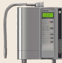
SD501 PL $4280

The all new Platinum features a revamped modern design that coordinates beautifully with today's stylish kitchens. It has the same powerful performance in an all-new package.